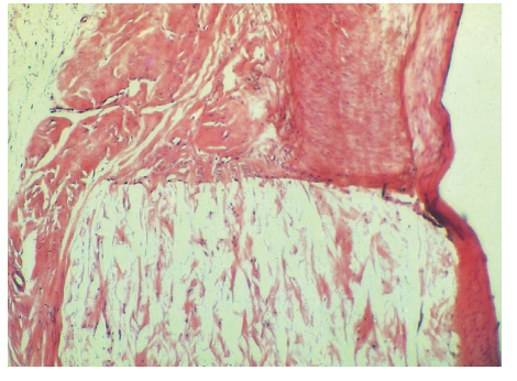
Dog carotid artery (H.E., x150) 39 months post implantation. Formation of a thin neointima on the Vascular–Patch (upper part of the picture). Ingrowth of fibroblast in the micro–porous patch structure.